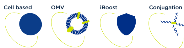
Figure 1: Vaccine platforms

With our wide range of expertise in the vaccine industry Intravacc is the one-stop-shop to mature your lead to a first-in-humans clinical study. In addition we can also provide CDMO services to push your vaccine candidate forward.